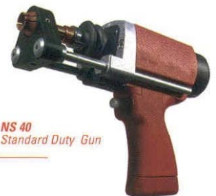
NS 40 Standard Duty Gun